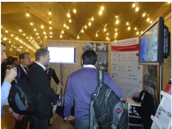
A group of people in the ICT Portugal stand.