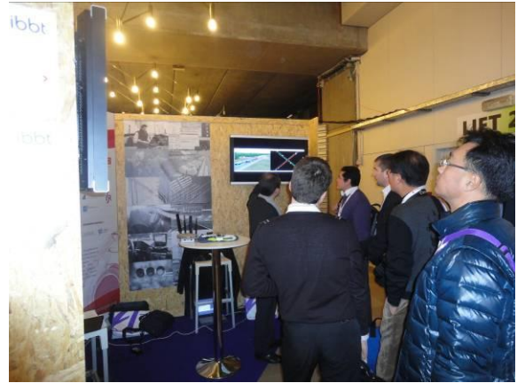
A group of people in the ICT Portugal stand.